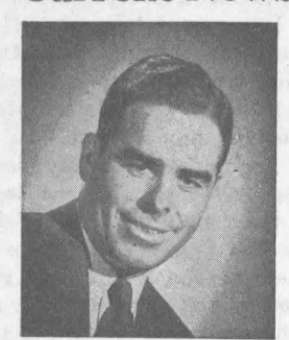
By Clayton Langford MOSCOW CONFERENCE TOTTERING

Leading members of the Western delegation expressed the belief that the Moscow Conference is foundering on economic issues. The lines of the East-West controversy began hardening on the German frontier problem.