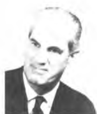
By Ralph Earle

A good closing illustration for this message can be found in the article entitled "The Man Who Wrote His Own Obituary," in the July, 1966, issue of the Reader's Digest .