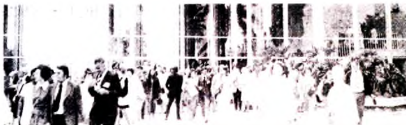
Some of the 1,400 upon adjournment