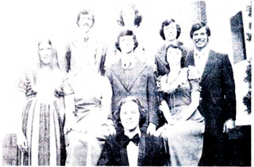
The "New Life" Singers

Madison (Tenn.) Church of the Nazarene announces the formation of its newest musical organization.