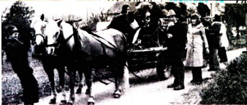
Students and staff find seats on their horse-drawn wagon for the trip to Thayngen.