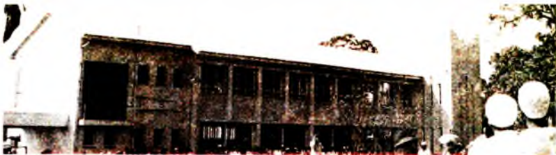
Main classroom building