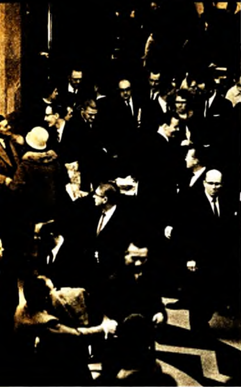
MILLING NAZARENES —Hundreds of Nazarenes who see each other only during general church conferences exchanged greetings in the Music Hall lobby. In the background the Nazarene Publishing House booth does a brisk business.

message is the source of our zeal in proclaiming it.”