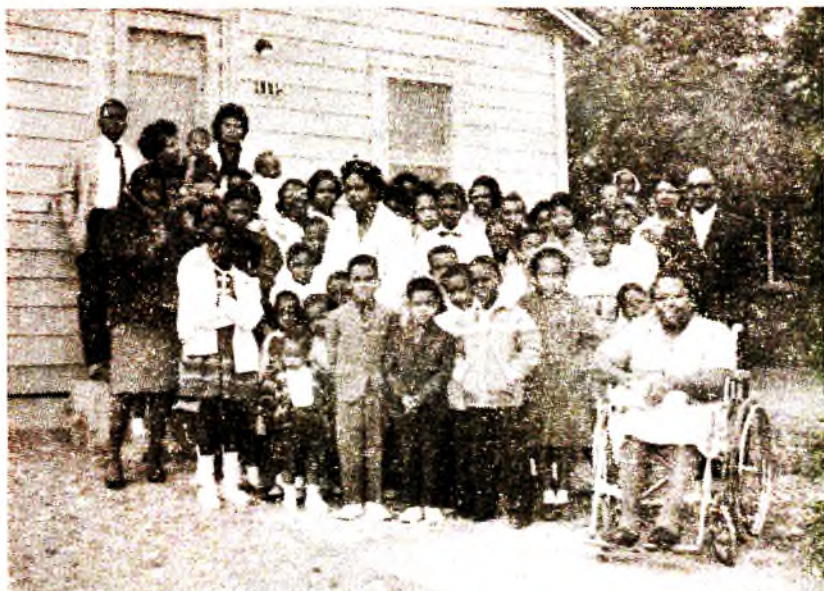
Sunday school group from San Antonio West End Church on Rally Day last November, when a record attendance of fifty-seven was reached. This picture was taken in front of the parsonage, which was remodeled recently, principally through funds from members of the Gulf Central Builder's Club.