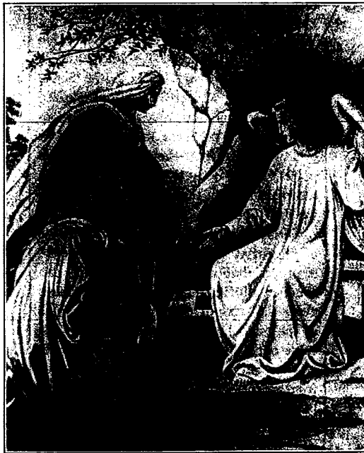
Christ is risen! He is risen indeed!

door of fear and dark despair, they crouch who were His own.