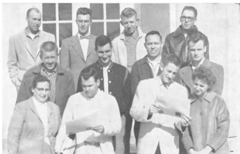
ENROLLMENT UP—(See story, page one). This is a group of new students enrolled for the winter quarter.

What is your idea? Should the 18-year-old be given a vote?