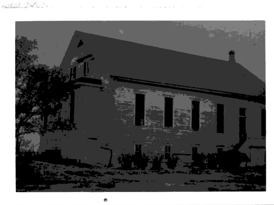
Fig. 2 Belle Sprin Built 189 Razed