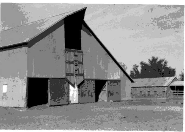
Fig. 4. - He man barn who Brethren lo feasts were prior to the building of bank